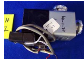
VARIAN Block valve KF16